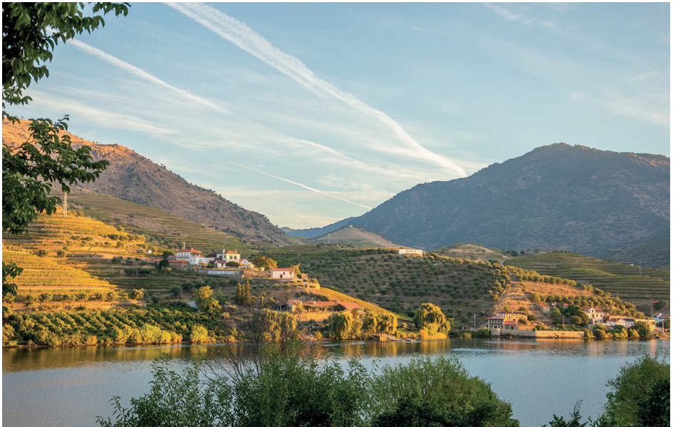
QUINTA DA SENHORA DA RIBEIRA

The cool and wet spring was a testing time for farmers. The third wettest spring at Bomfim of the last three decades necessitated preventative action in the vineyard to counter the threat of the damp conditions. While many across the region had a reduced crop, resulting in one of the smallest vintages of the last 20 years, the two flagship Dow's properties, Quinta do Bomfim and Senhora da Ribeira, emerged unscathed. Not only was the crop saved but its quality potential assured, laying the foundations for this vintage declaration.