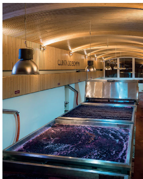
BOMFIM: THE LAGAR WINERY