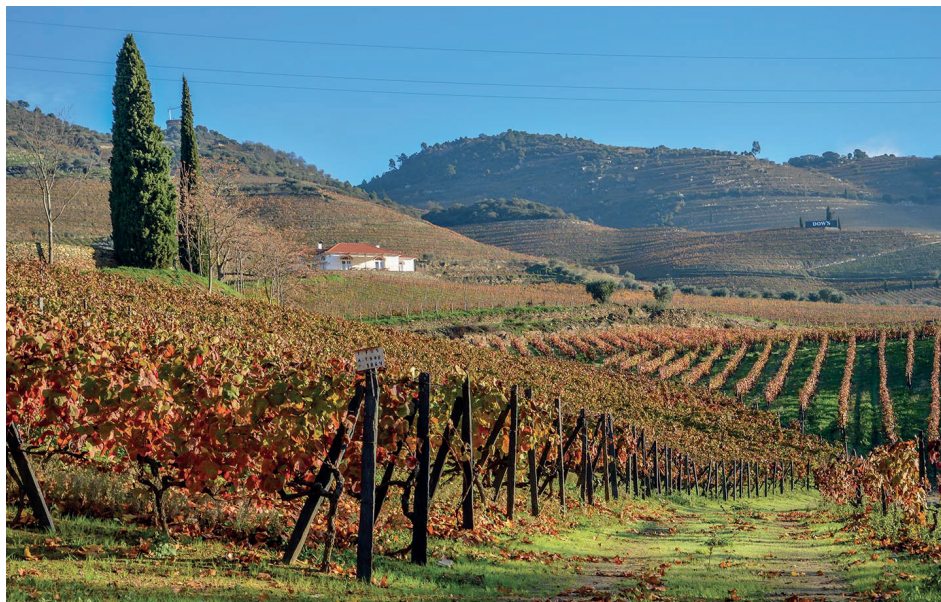
THE VINHA DOS ECOS (THE ECHOES VINEYARD) AT QUINTA DO BOMFIM