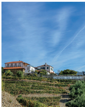
QUINTA DA SENHORA DA RIBEIRA